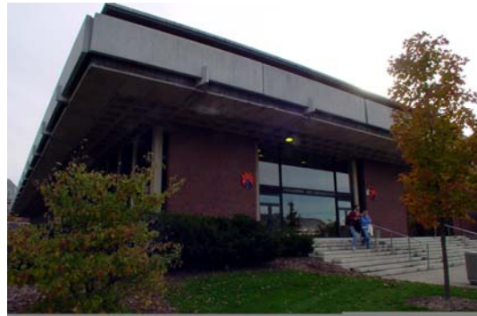
The Education Building