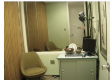
Another view of the newly designed interview rooms