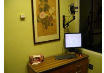
Technology in the newly designed interview rooms